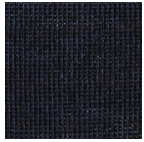
MEL MARINE 07.951