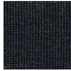
MEL INGLES 10.801