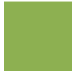
FRESH GREEN 09.250