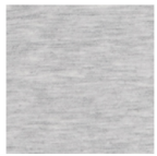
LIGHT GREY MELANGE 00.151