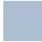
SKY BLUE 07.100