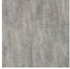
MELANGE 1 01.201