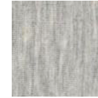
LIGHT GREY MELANGE 00.151