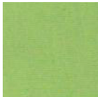
FRESH GREEN 09.250